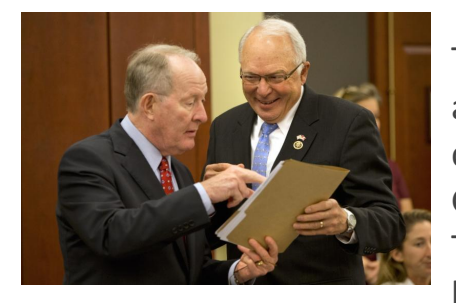
Sen. Alexander (l) and Rep. Kline discuss ESSA

The Every Child Succeeds Act, the latest name for the Elementary and Secondary Education Act, dramatically alters the accountability provisions of NCLB and reins in the U.S. Department of Education's waiver over-reach.