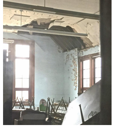
Detroit Public School, 2015