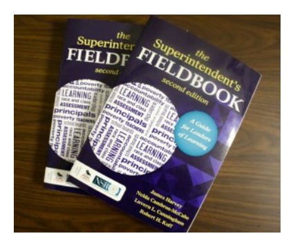
Best selling volume from the Roundtable. Order Superintendent's Fieldbook from Corwin Press.

Iceberg Effect Report Free downloads or purchase copies here .