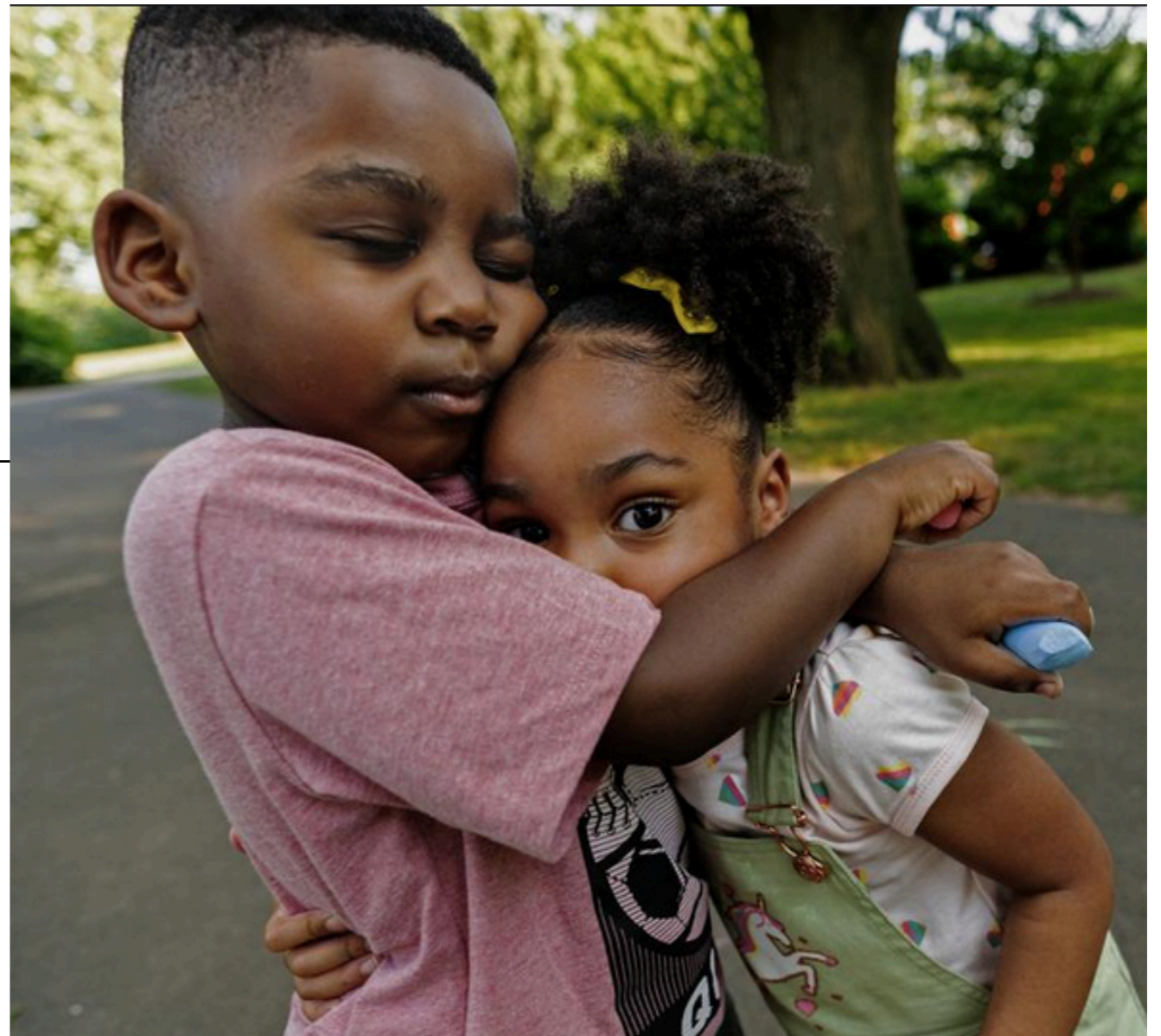
Georgia brother and sister orphaned by COVID-19

What Did You Do? But while nearly two-thirds of these respondents said they considered quitting, 83%