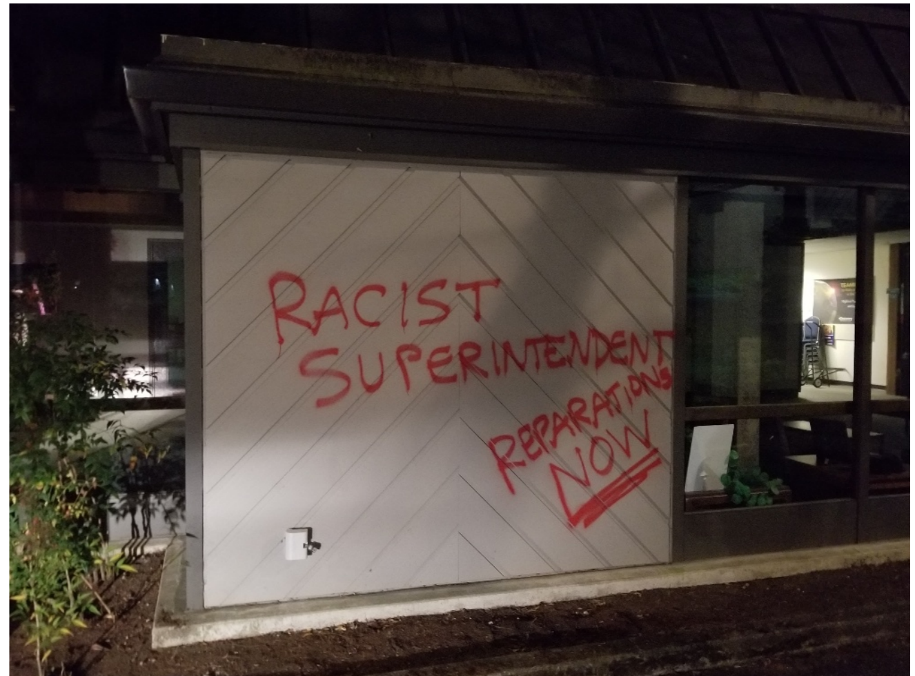
District office vandalized in Highline, Washington