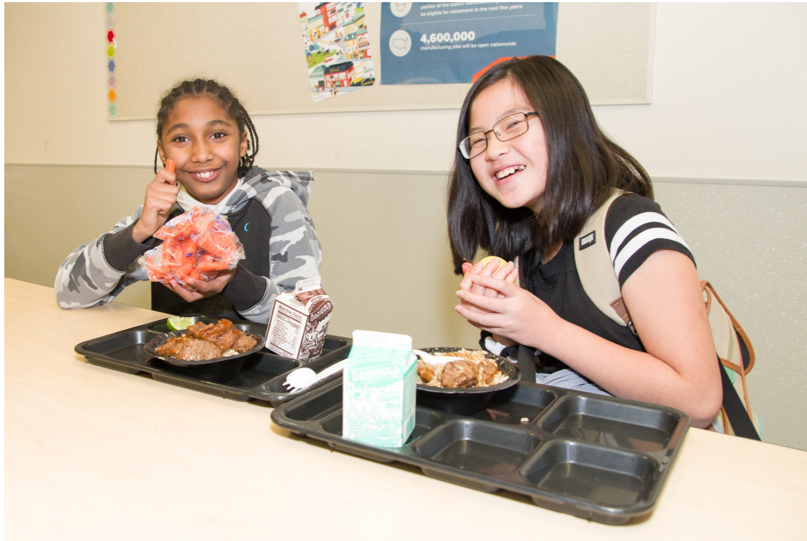
Students, the real hope for the future

during the pandemic probably weren't strong enough as individuals to deserve the job and should not have been there to begin with. A distinctly minority view, it ignores the reality that there's a difference between giving up (that respondent's interpretation) and knowing when you've had enough. It seems that many superintendents reached their breaking point—their own sense of dignity and self-worth required them to refuse to accept more abuse.