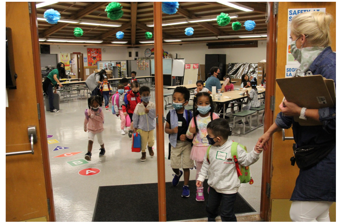
Elementary school teacher leads students to next activity

For teachers, however, a different storyline emerged: just 56% of these respondents agreed that fewer than one tenth of their teachers would need replacing, while one third anticipated that between 11 and 20% would need to be replaced and eight percent anticipated replacing between 21 and 30%. The findings for principals are similar to findings reported in August 2021 by the RAND Corporation, 5 while the Roundtable findings for teachers suggest considerably higher teacher turnover. As noted below, potential staffing crises for teachers and paraprofessionals are likely to be much more severe in small, rural districts than in those that are larger and better-resourced.