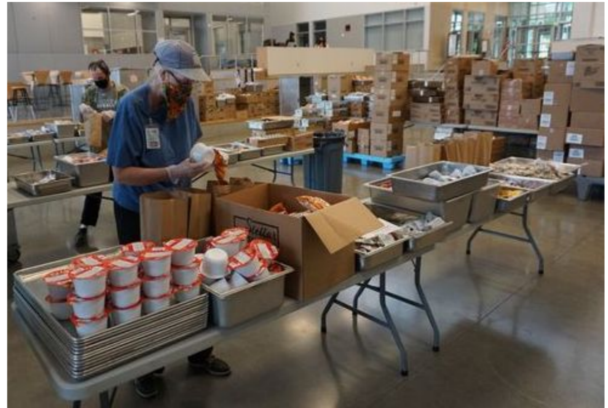
Cafeteria workers in one district prepare several hundred of the tens of millions of meals delivered daily to students and families in the spring of 2021

Board members are not immune from this abuse. Amidst stories of shouting matches and even brawls and fistfights at school board meetings, published accounts report a board member in Maine returning home late one evening after a contentious public board meeting to find the tires on