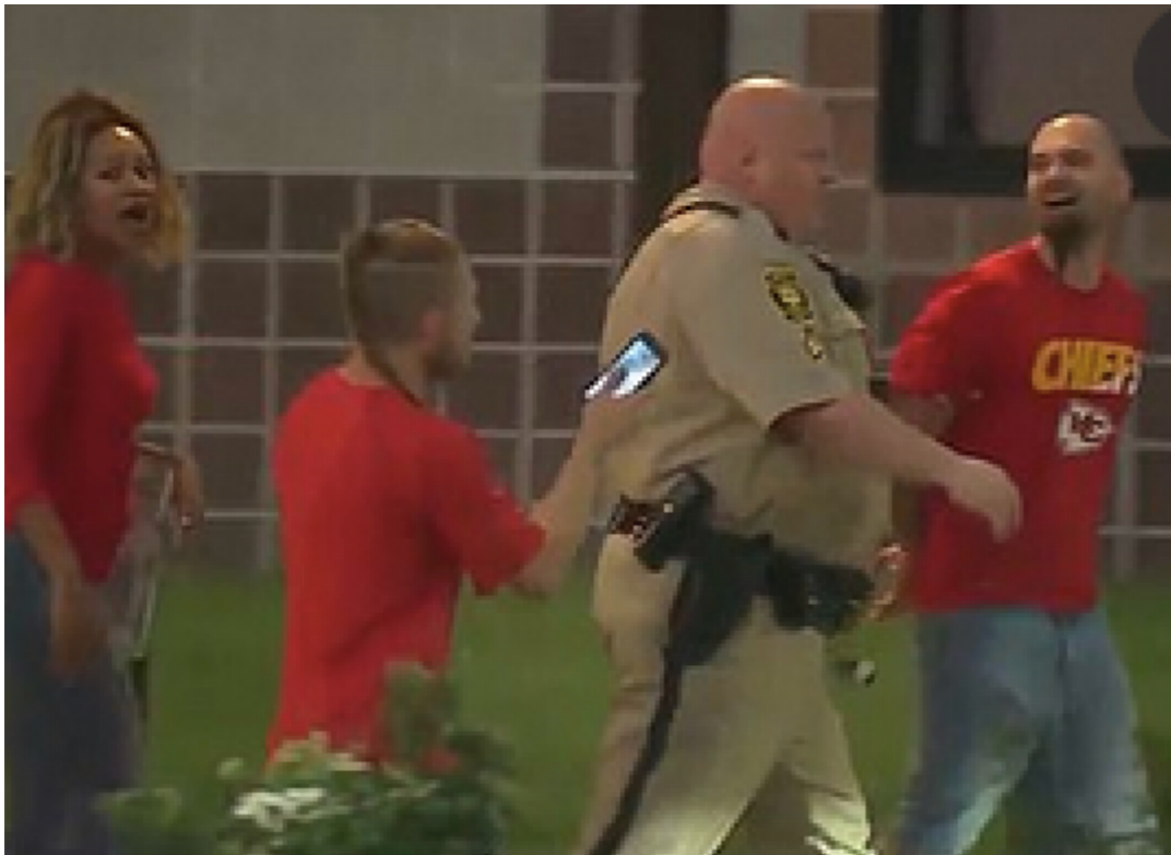
Sheriff arrests protestor objecting to Missouri board voting to require masks

reported they remained in their current position. Ten percent reported they retired and just 2.5% said they left the profession. It's impossible to know if these percentages are greatly different from those in a more typical school year. However, if 17% of all superintendents were leaving their positions, that would seem to indicate that more than 2,000 new superintendent vacancies were available during the summer of 2021, a considerable number, but far below the estimate of 4,000 – 5,000 vacancies cited earlier.